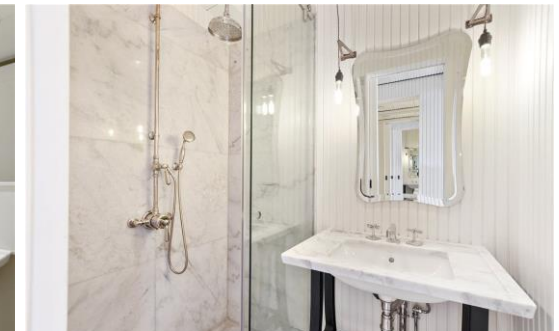
Belmont Street, NW1 Asking Price: £2,350,000, Share of Freehold